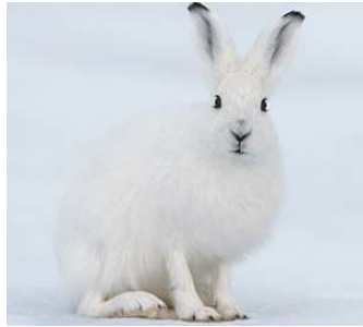
Arctic animals are usually white to keep them camouflaged in the snow.