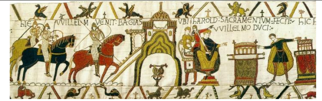
Part of the Bayeux Tapestry