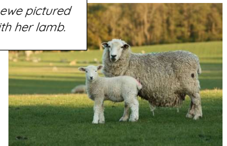
A ewe pictured with her lamb.