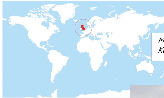
Map showing the United Kingdom in the world.