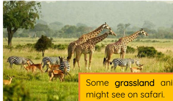
Some grassland animals you might see on safari.