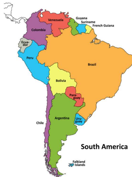
The countries of South America – there are twelve countries and two territories on this continent.