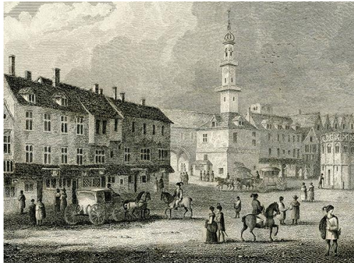
London in 1666