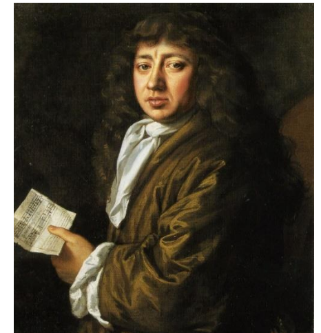
Samuel Pepys kept a famous diary which told us all about the fire.