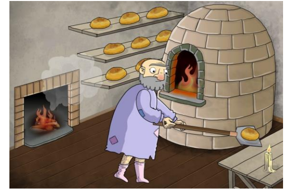
The fire started in a bakery in Pudding Lane. A baker called Thomas Farriner got the blame for it!

The Great Fire of London lasted 3 days. Lots of houses had to be rebuilt.