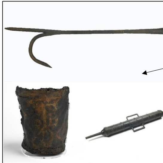
A fire hook, bucket and hose. These were old fashioned tools to put out the fire.