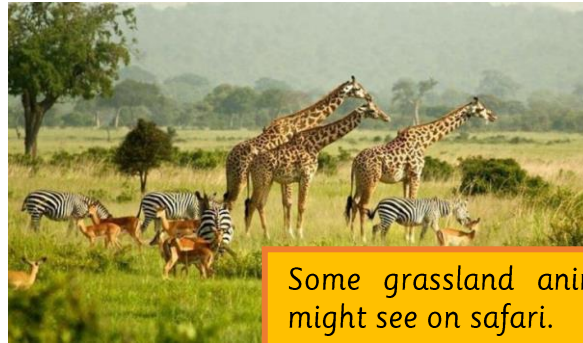
Some grassland animals you might see on safari.