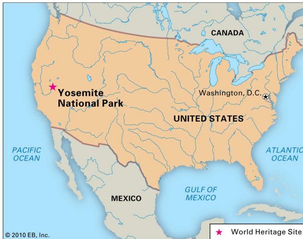
Location of the Yosemite National Park within the country of the United States of America.