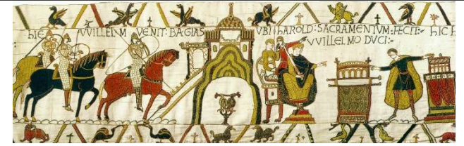
Part of the Bayeux Tapestry