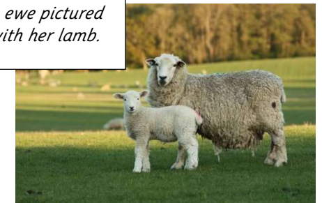
A ewe pictured with her lamb.