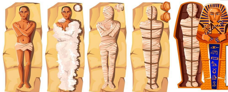
Ancient Egyptians used to mummify their dead to preserve their bodies.