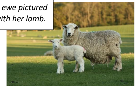
A ewe pictured with her lamb.