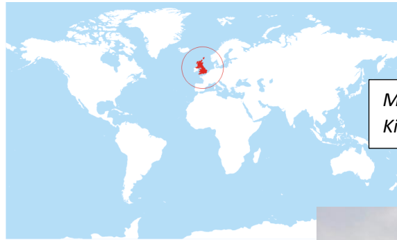
Map showing the United Kingdom in the world.