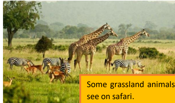
Some grassland animals you might see on safari.