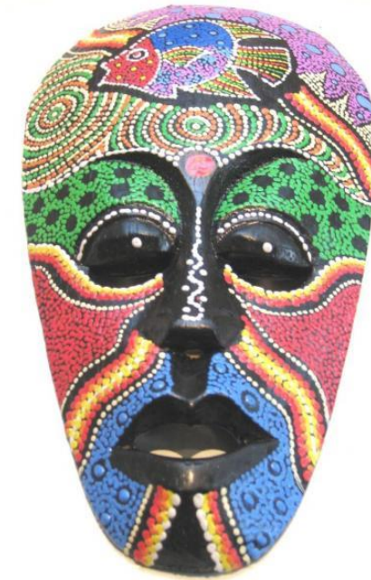
There are some fantastic African folk stories that have been retold through the Tinga Tinga Tales. We will be learning some of them in English.